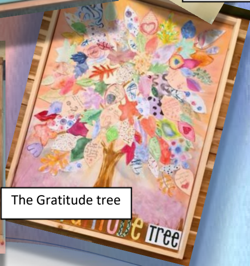
The Gratitude tree