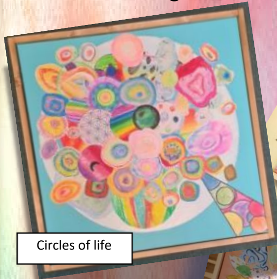
Circles of life