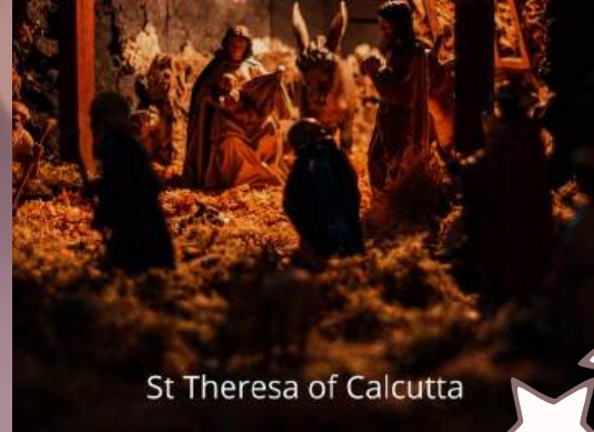
St Theresa of Calcutta

At this Christmas when Christ comes, will He find a warm heart? Mark the season of Advent by loving and serving the others with God's own love and concern